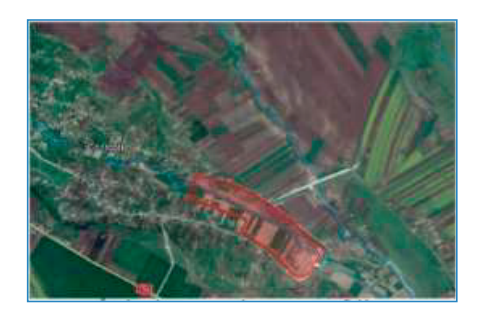
Figure 1. Area location

modified settlement, on horizons, for physicalchemical analysis.