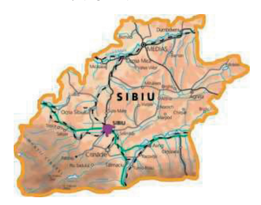
Figure 1. Map of Sibiu County, Romania

The landfill analysed in this study is located in Sibiu County (Figure 1).