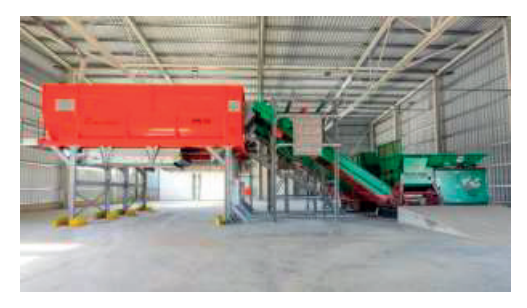
Figure 2. Waste treatment plant from Sibiu County

Water will have values below the usual standards for drinking water, in terms of salt content and can thus be well used as industrial water or for other purposes; ex. irrigation of parks public buildings, gardens, orchards, etc. The maximum storage capacity is 1125000 m<sup>3</sup> for the third cell of landfill (Figure 2).