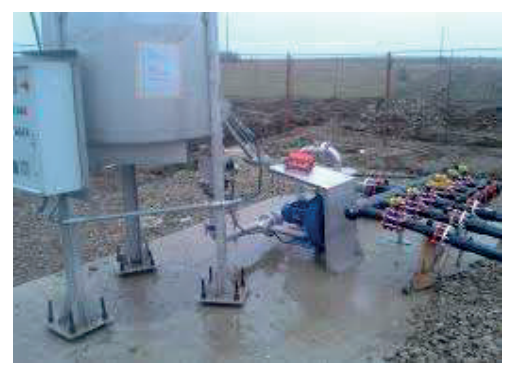
Figure 3. The biogas installation from Sibiu County

The biogas installation is related in Figure 3.