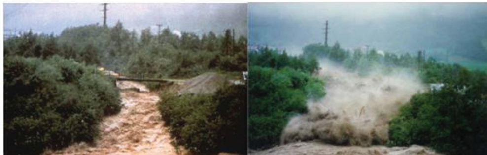
Figure 5. Flash-floods – Stream in Zavruggia, July 18, 1987 (FOEN, 2000)

The most obvious effect is bound to surface water flow, lack of forest belts (natural or anthropogenic) being the main cause of “flash-floods” recorded (Figure 5).