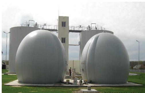
Figure 6. Methane tanks and fermenters for sludge processing

For sludge produced within watertreatment plants, whose organic load is high, it can be chosen to plug in methane tanks (Figure 6).