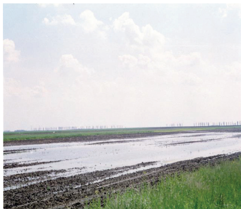
Figure 4. Surfaces affected by moisture excess

minimal environmental impact in a mixt system of natural and agricultural areas; it is minimal environmental impact in a mixt system, of natural and agricultural areas; it is also important to identify and treat the moisture excess causes, not just the effects (Figure 4)