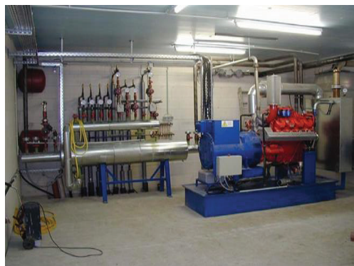
Figure 7. Cogeneration unit with thermal heat recovery from flue gases

does not involve major impact on the air. The remaining solid part has characteristics of an agricultural fertilizer. Operating temperatures are reduced and materials used in installations are cheap (Figure 7).