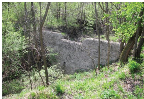
Figure 3. Soil erosion dam and vegetation planted

Strategy of wetlands valorization has evolved according to historical economic policy.