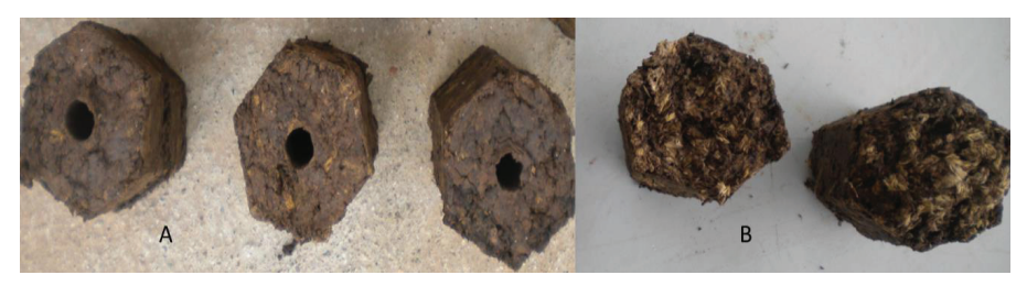
Figure 2. (A) Hollow-core hexagonal briquettes; (B) full hexagonal briquettes