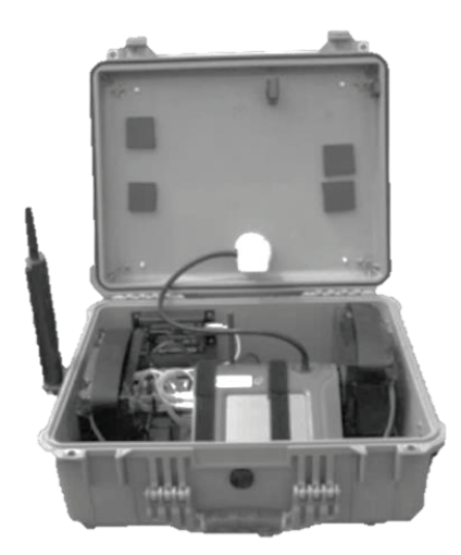
Figure 1. TSI DustTrak DRX 8533 particulate matter (PM)monitor, which allows the simultaneous measuring of various PM fractions i.e. PM1/submicrometric, PM2.5/fine, Respirable/PM4, PM10/Thoracic, and Total PM (http://www.tsi.com)

concentrations i.e. PM1, PM2.5, PM4, PM10, 0.001-150 and TPM over mg/m3asconcentration range. The method combines a photometric measurement to assess the mass concentration range and a single particle detection measurement to allow the sizing of the sampled aerosol (TSI, 2016). Aerosol is directed into the sensing chamber in a continuous stream using a diaphragm pump. Part of the aerosol stream is split ahead of the sensing chamber and passed through a HEPA filter being injected back into the chamber around the inlet nozzle as sheath flow (TSI, 2016). The remaining sample flow passes through the inlet entering the sensing chamber. In this chamber, a sheet of laser light illuminates the sample. A laser diode forms the sheet of laser light. In the first step, the light emitted from the laser diode passes through a collimating lens and then through a cylindrical lens to create a thin sheet of light (TSI, 2016). A gold-coated spherical mirror captures a significant fraction of the light scattered by the particles and focuses it on to a photo detector (www.tsi.com).