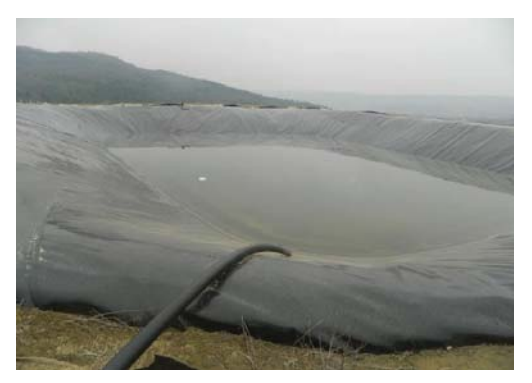
Figure 5. Storage and water heating tank

This tank (Figure 5) has a key role in the performance of the irrigation system: