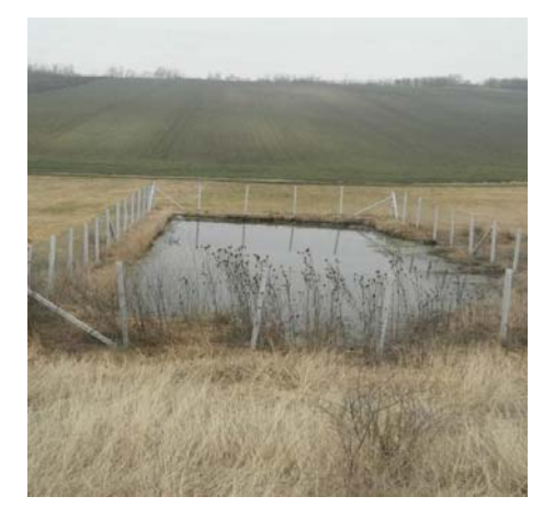
Figure 4. Catchment - accumulation basin

- Catchment – accumulation basin (Figure 4) consists of an open basin with a total area of 230 \text{ m}^2 and a total depth of 3.00 m.