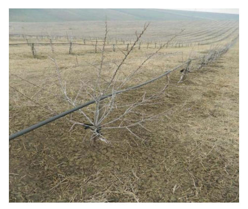
Figure 2. The used variety of sea buckthorn for the plantation establishment

The designed irrigation system includes the following components (Figure 3):