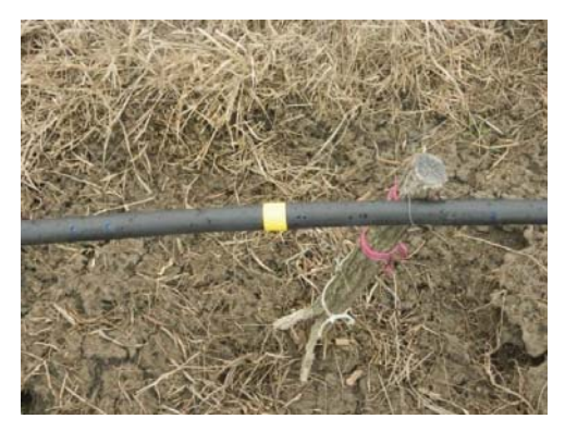
Figure 6. The watering pipe

Watering pipes (Figure 6) are mounted on the surface of the land being held by wooden stakes at a height of about 50 cm from place to place. In these pipes are installed from 1.5 to 1.5 m prefabricated droppers which discharge a constant flow as long as the pressure in the watering pipe is between 1.5 and 4.5 bar.