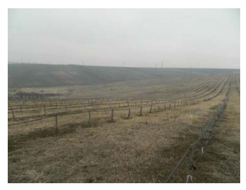
Figure 1. Overview of the drip irrigation system

The drip irrigation system (Figure 1) designed by the authors of this paper was done on a slope ground, on an area of 20 ha, located near Iasi city.