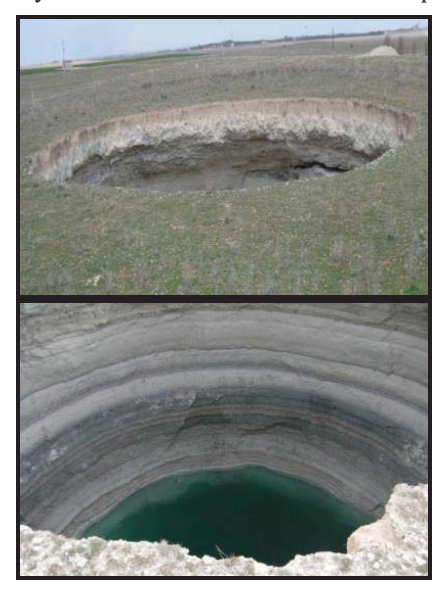
Figure 6. İnoba Sinkhole

Yarımoğlu Sinkhole: It's located in the Akkuyu Plateau in the west of Karapınar