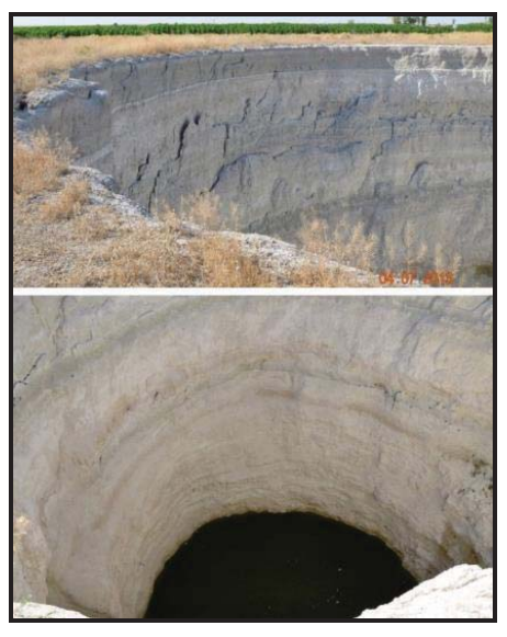
Figure 7. Yarımoğlu Sinkhole

district center. Sinkhole is occured in the agriculture lands. When sinkhole was occured corn was field land. The sinkhole emerged in 2009 in soil, clay and marly alluvion formations. Its upper elevation is 1010 meters. While the sinkhole had a caliber of 25 meters when it first emerged, the caliber has raised up to 28 meters in present day. Water exists at the part after almost 49 meters of sinkhole (Figure 7). Yarımoğlu Sinkhole attracts tourists as it is highly close to Konya-Adana highway. Edge of the sinkhole has been covered with simple barb wires. There's a serious danger for people visiting the sinkhole. Currently 350 m<sup>2</sup> there agriculture land were destroyed by sinkhole.