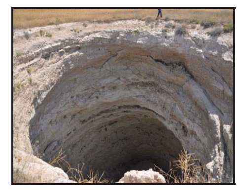
Figure 8. Nebili Sinkhole

upper surface and water level. It's observed that the shielless sinkhole presents a danger for