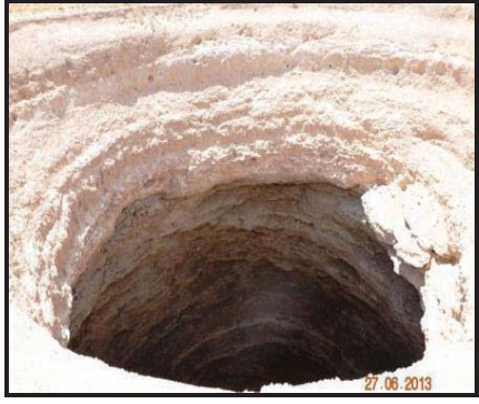
Figure 9. Akviran Sinkhole

living beings. Currently 190 \text{ m}^2 there agriculture land were destroyed by sinkhole.