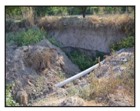
Figure 11. İçeriçumra Abaz Sinkhole plugged following its emergence

limestone, clay and marley layers on the slopes of the sinkhole could be prominently seen (Figure 10). Moreover, although the sinkhole hadn't been named yet, we stated that it would be proper to name it Çakıllı Sinkhole as the location where it had emerged was Çakıllar (Bozyiğit-Tapur, 2009:149). However, when we went there to make a more detailed research, it was observed that the sinkhole had totally been plugged.