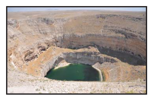
Figure 4. Çıralı Sinkhole Lake from north

Timraş Sinkhole: It's in the southeast of Village Gökhüyük in Çumra (Figure 5). The ellipse sinkhole's upper surface long axis' caliber in north-south direction is sketchy 325 meters, its short axis in east-west direction is 245 meters, lake surface's long axis is 242 meters, its short axis is 197 meters. Its upper elevation is 1035 meters, its lake surface elevation is 1005 meters and there's a range of about 25 meters between upper surface and Lake Surface. Water depth of the sinkhole is 40 meters. The sinkhole had emerged in Upper Miocene-Pliocene old limestone, marl and sandy-clayey formations.