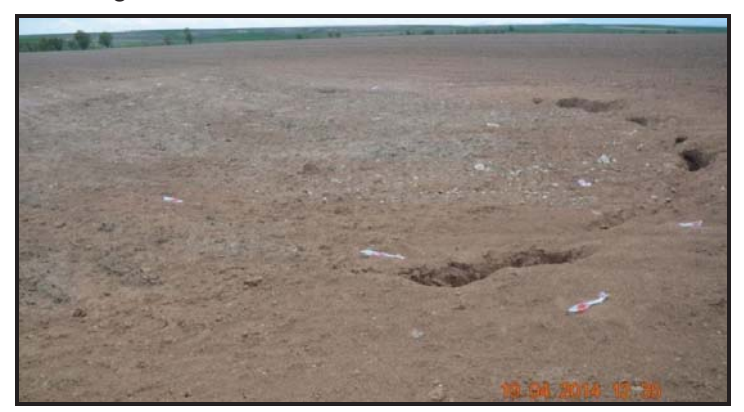
Figure 13. The closed display of Kadınhanı Hançerli Sinkhole after 6 months

months after it was plugged (Figure 13). Plugging it increases the possibility of a bigger collapse as the sinkhole hasn't totally collapsed. Although the owner of the farm where sinkhole emerged was informed about this danger, he didn't give up his insistence. He carries on his agricultural activities by plugging the sinkhole emerging on his farm.