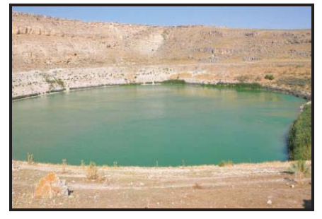
Figure 3. Meyil Sinkhole from North