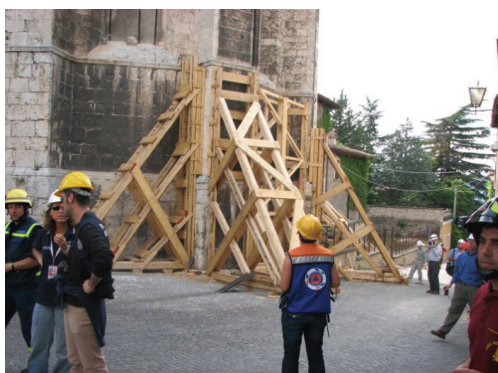
Figure 4. Emergency measures to secure a building after earthquake

From the first hours after the earthquake, the fire crews went to secure the buildings seriously damaged (Figure 4). This measure applies, however, and about two months after the seismic event.