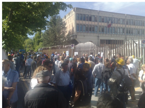
Figure 2. Inspection teams with owners of damaged buildings