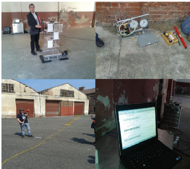
Figure 5. Devices used for advanced buildings assessment