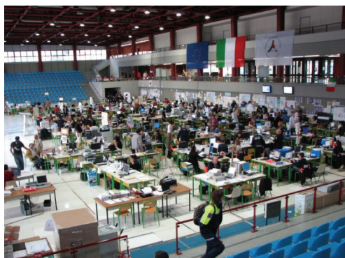
Figure 1. Organize command centre DI.COMA.C

The Department of Command and Control was established in the town of L'Aquila in only three to four hours after the earthquake on his 06.04.2009, carrying on all the activities of coordination and control in a sports hall belongs to the Financial Guard.