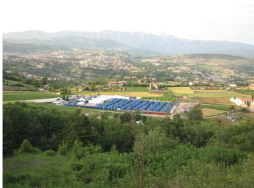
Figure 3. Camp tent near L'Aquila town

After the earthquake, the L'Aquila village was evacuated and about half of the residents were accommodated in tents placed in available spaces by Civil Protection teams (Figure 3).