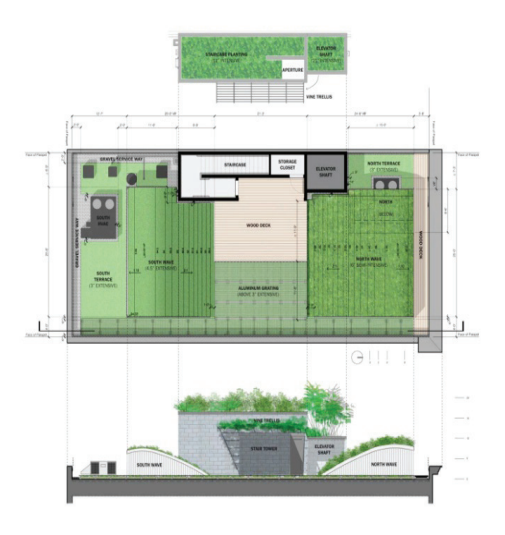
Figure 3. Overhead and cross section schematics

few extensive and semi-intensive green roof performance data of full report. Energy savings: Engineering analysis showed that the green roof created a 10% reduction in building energy use during winter months and negligible difference in the summer. Further analyses showed that ASLA should show a 2-3% savings in the summer in the identified cause of this deficit - overcooling of the building. Following the engineer's guidance, ASLA will change cooling of the building and will follow up with further monitoring. Water retention: From July, 2007 to May, 2007, the green roof retained nearly 75% of the total rainfall (736mm). This kept 105 000 liters out of the city sewer system. The roof typically retained 100% of (25 mm) rainfall. Water quality: The green roof did not add any nitrogen to the runoff. Water quality testing shows that the water runoff contains fewer pollutants than typical water runoff. Most significantly, the roof is reducing the amount of nitrogen entering the watershed (Somerville, 2007).